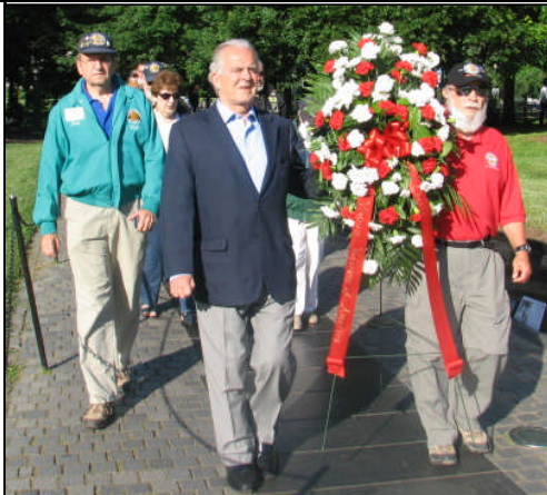
Where are you? AWOL? No excuse, Sir!